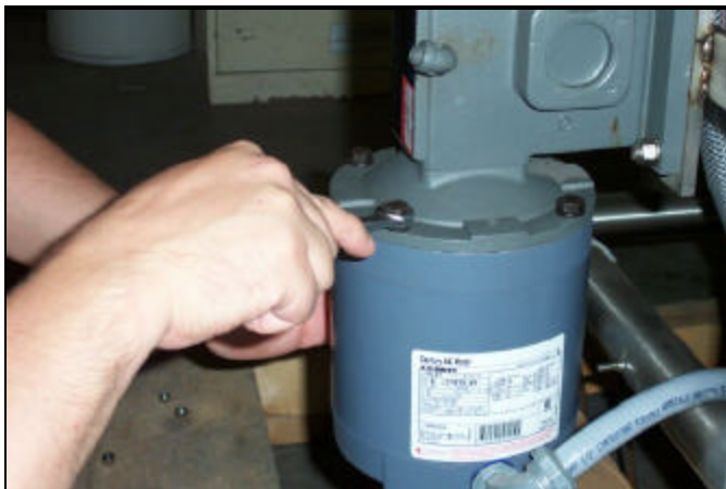
Removing the bolts holding the drive motor to the gear reducer.